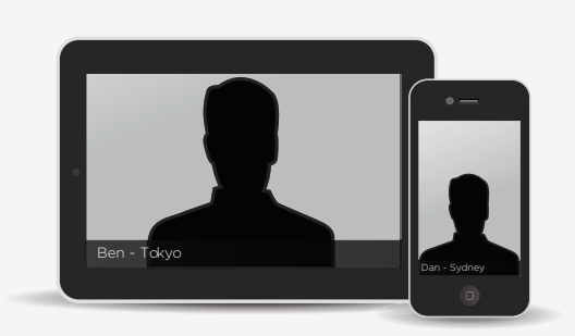
80% of Fortune 100 companies are deploying iPhone and iPad devices.<sup>2</sup>