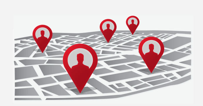
50% of information workers work from multiple locations.<sup>1</sup>

about communication, IT, security, management and more. But they can help you provide efficient, productive processes that would've been unthinkable even a few years ago. Let's take a look at five examples to explore how today's collaboration solutions can help you work smarter, not harder.